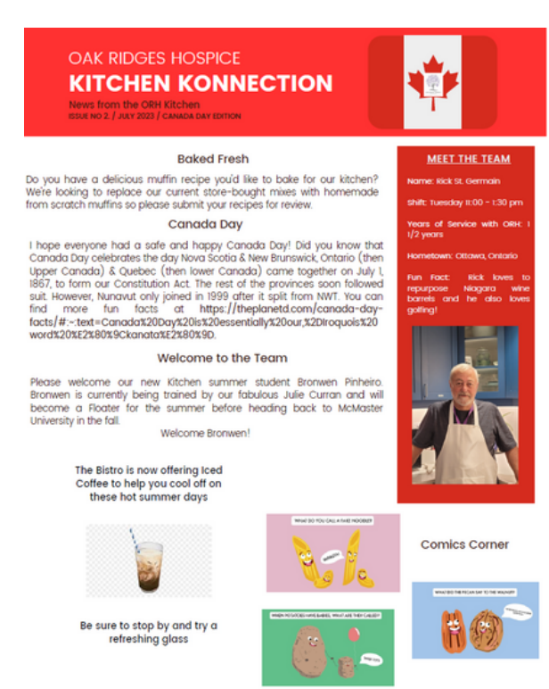
Kitchen Konnection - July